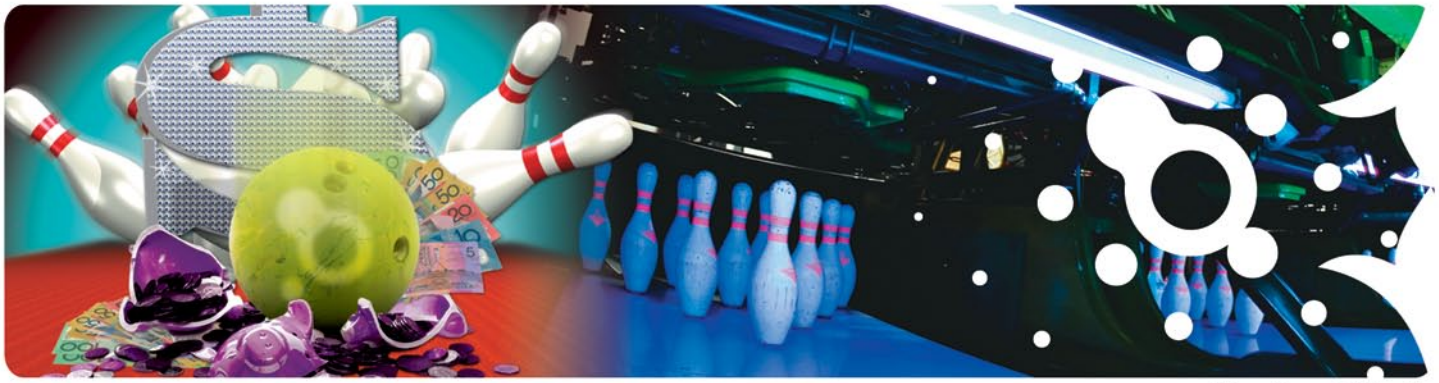
Pin setters at Kingpin