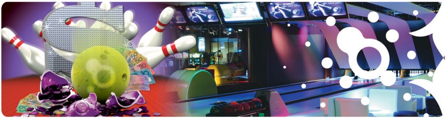
Photo lanes at Kingpin Crown