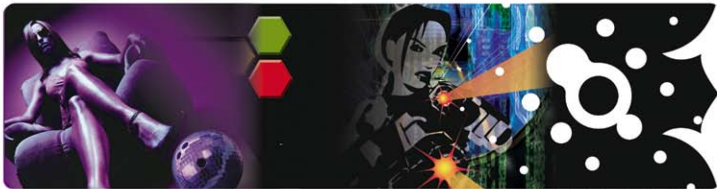
Let the battle begin... M9 Laser Skirmish