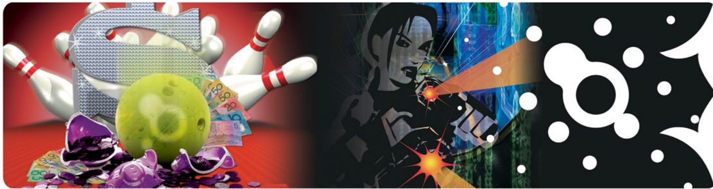
Let the battle begin... M9 Laser Skirmish