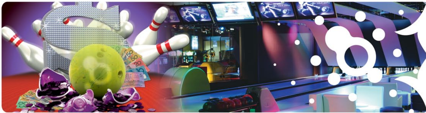
Photo lanes at Kingpin Crown