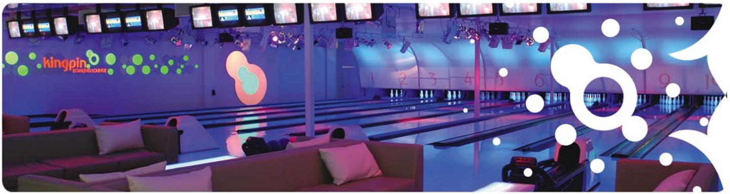
Lanes at Kingpin Richmond