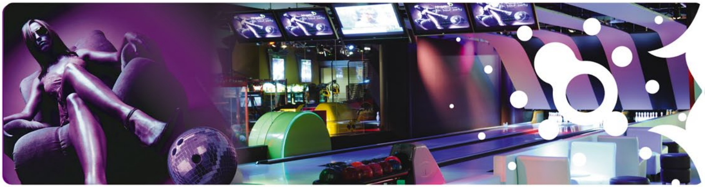
Photo lanes at Kingpin Crown