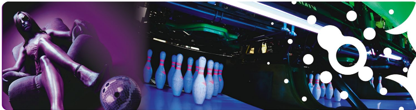
Pin setters at Kingpin