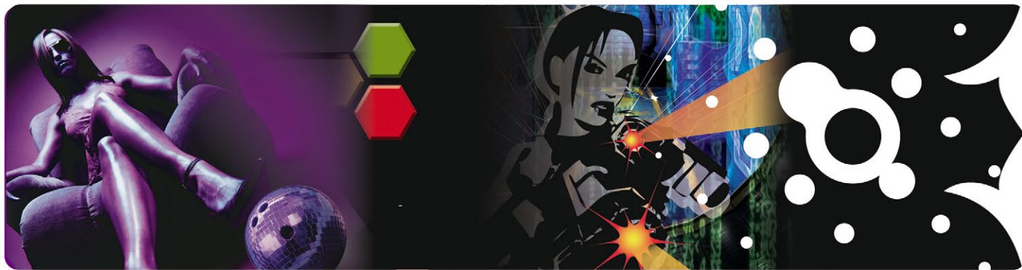
Let the battle begin... M9 Laser Skirmish