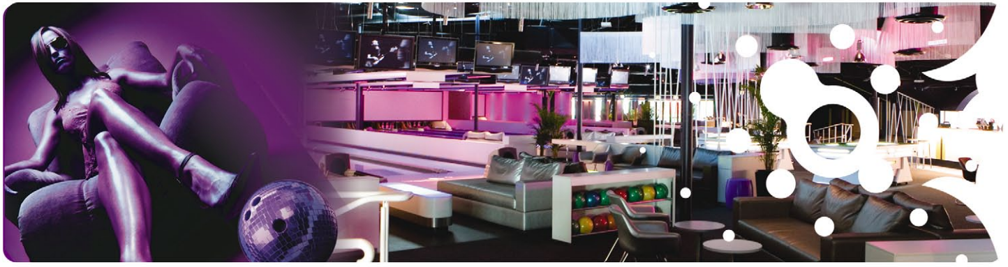
Venue picture of Kingpin Darling Harbour