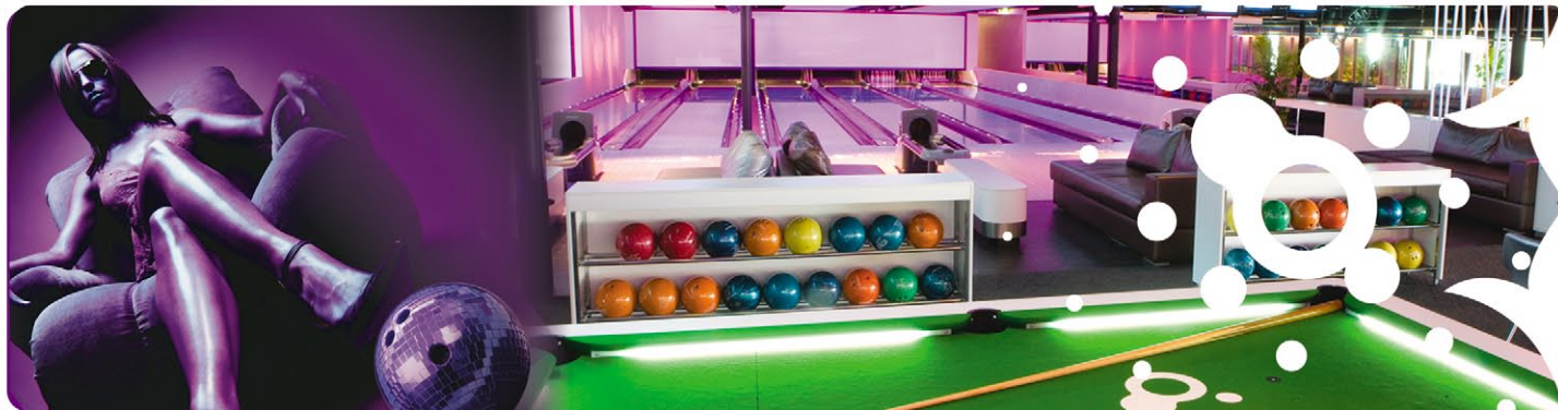
Pool tables & lanes at Kingpin Darling Harbour