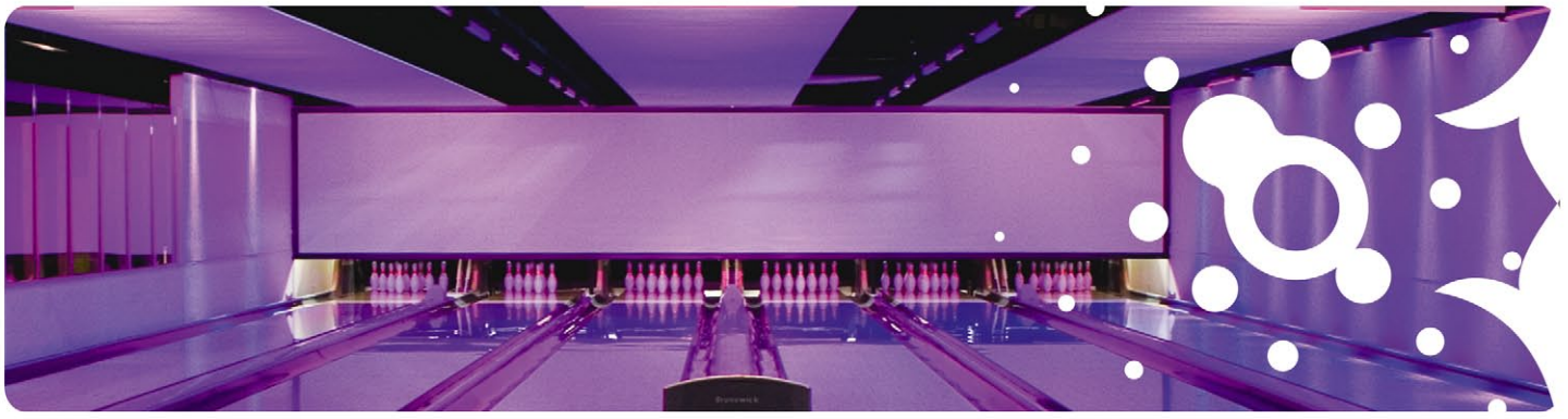
Lanes at Kingpin Darling Harbour