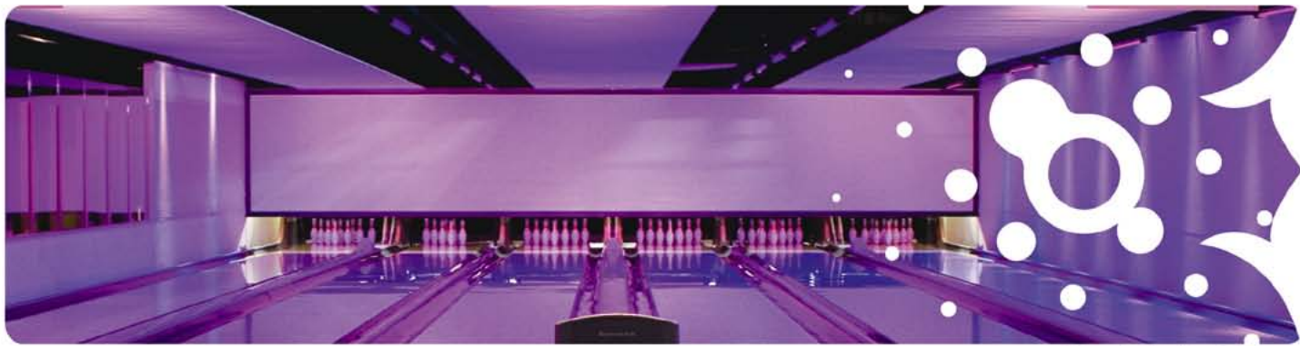
Lanes at Kingpin Darling Harbour