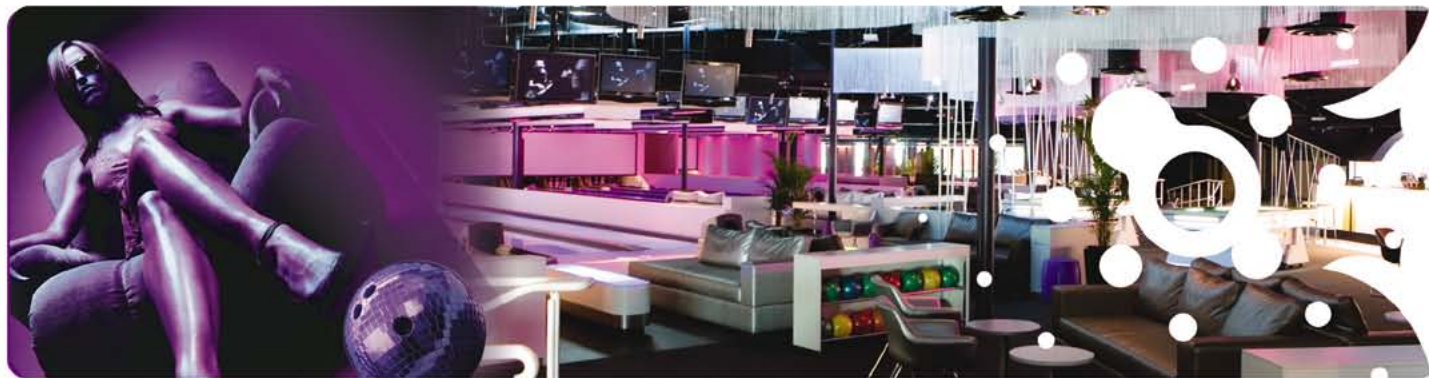
Venue picture of Kingpin Darling Harbour