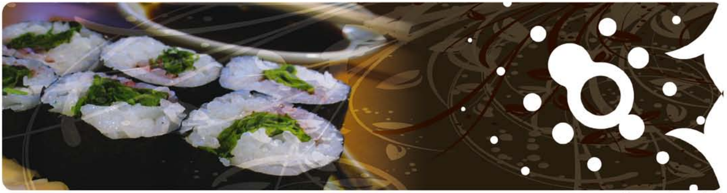
Gourmet finger food