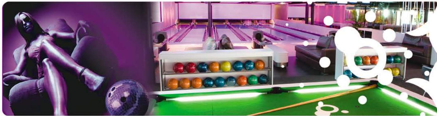
Pool tables & lanes at Kingpin Darling Harbour