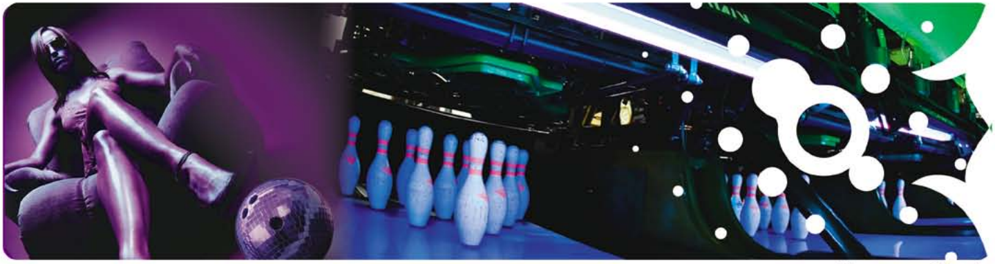
Pin setters at Kingpin