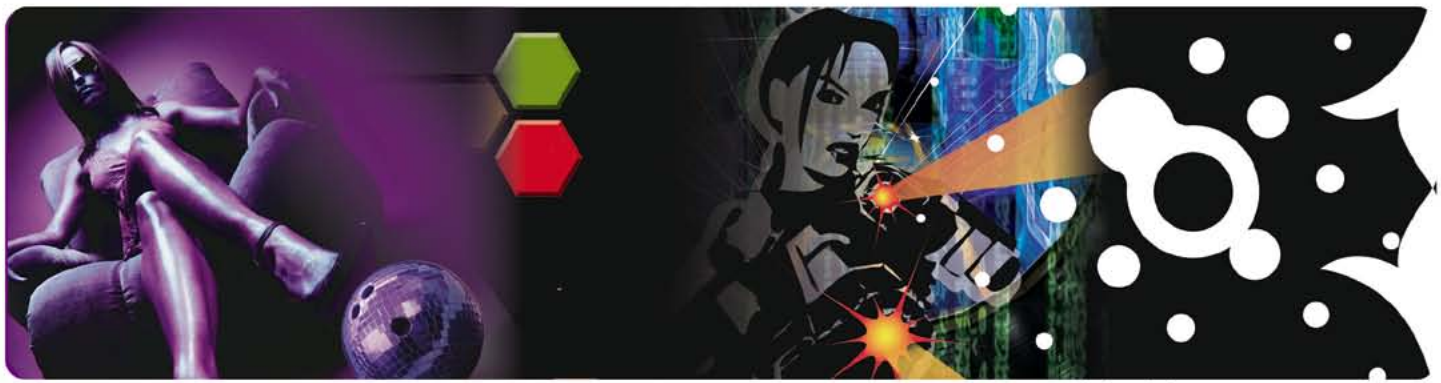
Let the battle begin... M9 Laser Skirmish