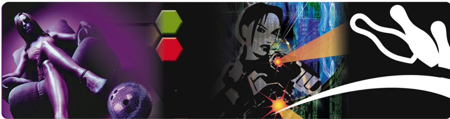
Let the battle begin... M9 Laser Skirmish