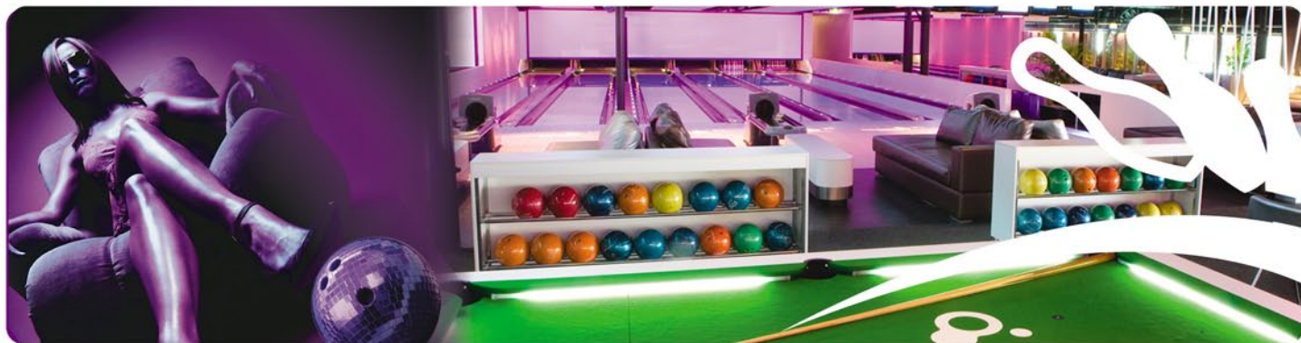
Pool tables & lanes at Kingpin Darling Harbour