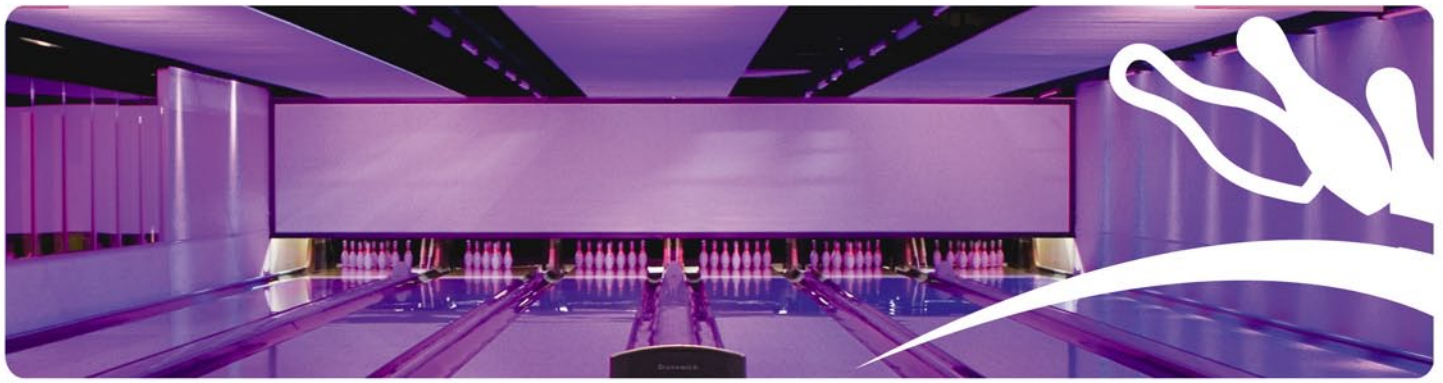
Lanes at Kingpin Darling Harbour